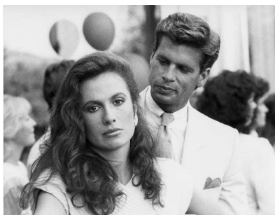
Ana - Alicia and Lorenzo Lamas at the opening party of the Del Oro in episode 131.