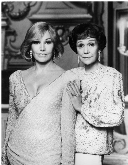
Kim Novak and Jane Wyman in the 1986-87 season.