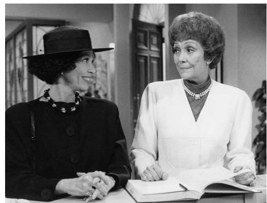
Leslie Caron and Jane Wyman in the premiere of season 7.