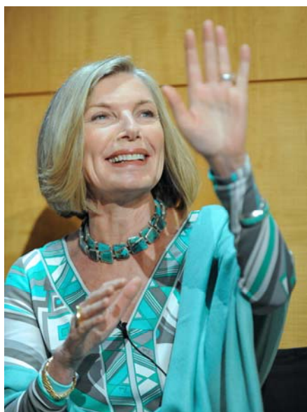
Left: Susan Sullivan arriving at the Paley Center (above) and during the panel.