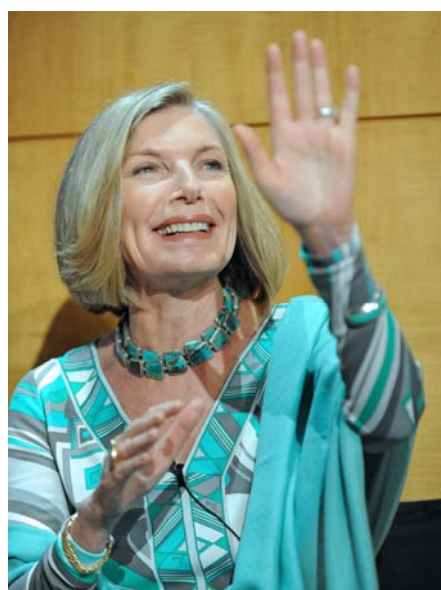
Left: Susan Sullivan arriving at the Paley Center (above) and during the panel.