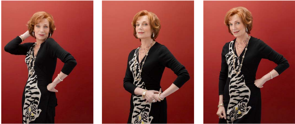
Susan Sullivan as Martha Rodgers on Castle .