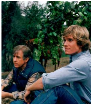
Clu Gulager (Chase Gioberti) and Billy Moses (Cole Gioberti) during a scene at Chateau Chevalier with fake vines and grapes in the background (act 2, scene 27).

You mentioned in our communication before this interview that you worked as a stand-in for Lorenzo. Could you please describe your duties and your typical workday on the set?