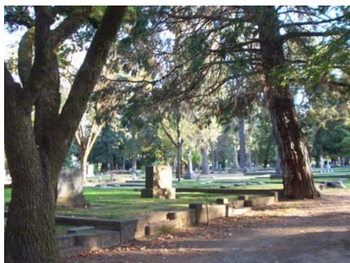
A 2007 view of the burial site: Not much has changed at the St. Helena Public Cemetery since the shootings of Falcon Crest took place.