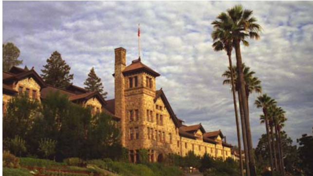
A 1997 photo of the old Christian Brothers Winery .

“The Christian Brothers Winery was never used... though one local winery was used, but I forget which one. They needed some interior wine scenes,” he added.