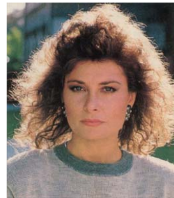
Jane Badler's character, Meredith Braxton, was originally intended to be Erin's lesbian girlfriend.